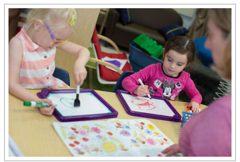
STURGEON HEIGHTS SCHOOL

2017 - 2018 New Registrant Information Booklet