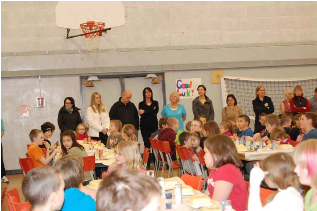
Students, staff, volunteers and family members joined together for our Shrove Tuesday Pancake Lunch.

Sturgeon Heights School 50 Hogan Road St. Albert, Alberta T8N 3X7