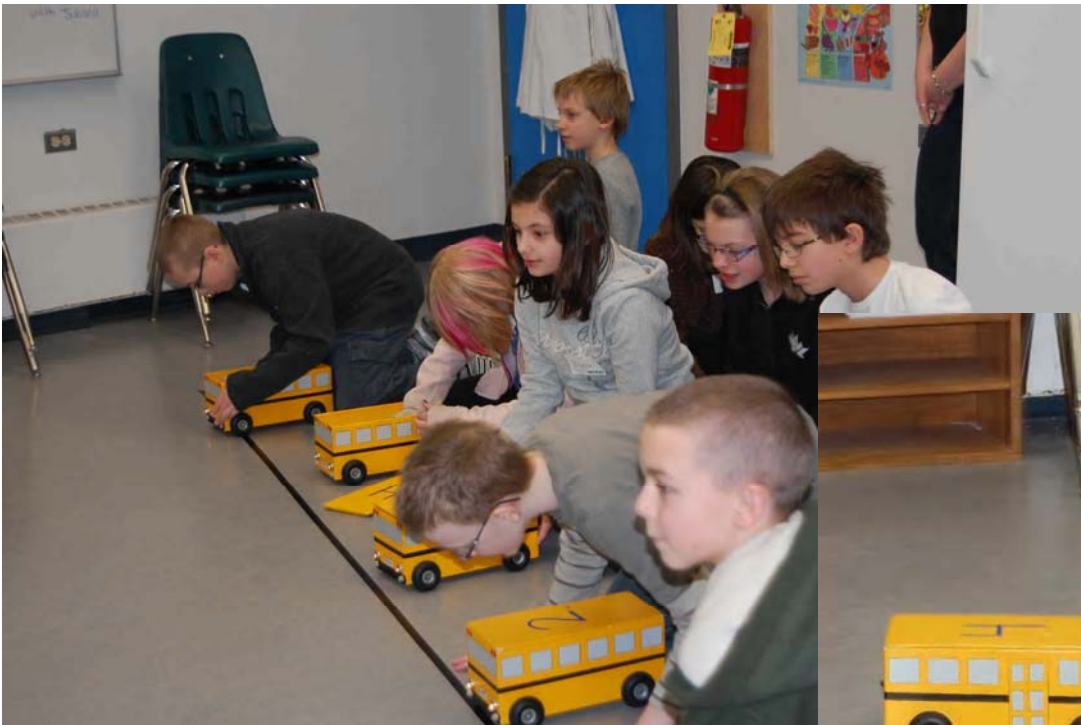
Grade 5 students enjoyed their projects with Hands-On Science!

As mentioned in our last newsletter, students and staff are in the planning stages of putting together a Learning Garden project that will involve students from the design stages through construction of the garden and ongoing maintenance and development. It will become a tool for learning and a catalyst for deeper understanding. We are hopeful that parents will also become involved in this project. If you are aware of any grants, resources or have access to supplies or services that will assist us in keeping costs down, please call the school. As Spring approaches one of our first jobs will be to rototill the garden area in preparation for planting. If you could spare the time to bring in a machine to accomplish this for us – it would be greatly appreciated. Please call the school and let us know if this can work for you!